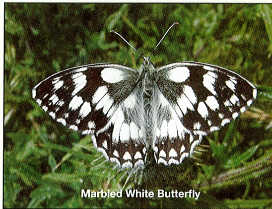
Marbled White Butterfly

Local Nature Reserves (LNRs) are all about connecting people and wildlife. They are statutory designations, looking after biodiversity and giving people the opportunity to experience the natural world on their doorstep. They are a shop window for best practice, promoting ways in which to help the wildlife on your own patch. They are also an education resource for schools and colleges, providing an outdoor classroom for hands-on learning.