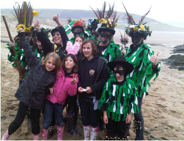
Croyde Beach Clean

Meet / park in field accessed via gateway next to Lower Winsford, Abbotsham Grid ref: 432 266 at 10am