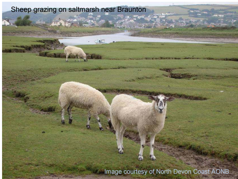
Sheep grazing on saltmarsh near Braunton

Braunton Great Field and Marsh is designated heritage coast and as such is protected by ENV3 and ENV5 policies of the NDC local plan. The LDF strategy backs the proposed AONB extension to expand into Braunton Great Field and Marsh therefore affording a greater degree of protection to this site. This EMP also supports the change of designation for this historically and environmentally important site