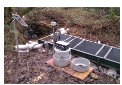
Instrumented flume for collection of water samples

All monitoring equipment connects to a 3G telemetry network, providing researchers at the University of Exeter with a 'live' data feed and the ability to remotely trigger the pump sampler, allowing sampling through a range of conditions.