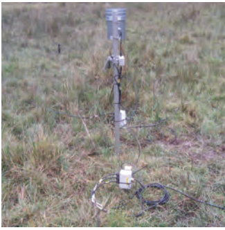
Telemetry base station

Each study site has 9 dipwells (3 within each plot). 6 of which are used to monitor the water table level and how this changes in response and relation to rainfall events, whilst the remaining 3 are used for water sample collection. Additionally. Stowford Moor is equipped with an instrumented flume which allows the amount of water leaving the