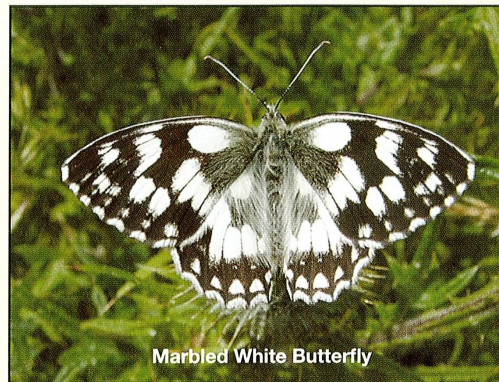
Marbled White Butterfly

Local Nature Reserves (LNRs) are all about connecting people and wildlife. They are statutory designations, looking after biodiversity and giving people the opportunity to experience the natural world on their doorstep. They are a shop window for best practice, promoting ways in which to help the wildlife on your own patch. They are also an education resource for schools and colleges, providing an outdoor classroom for hands-on learning.