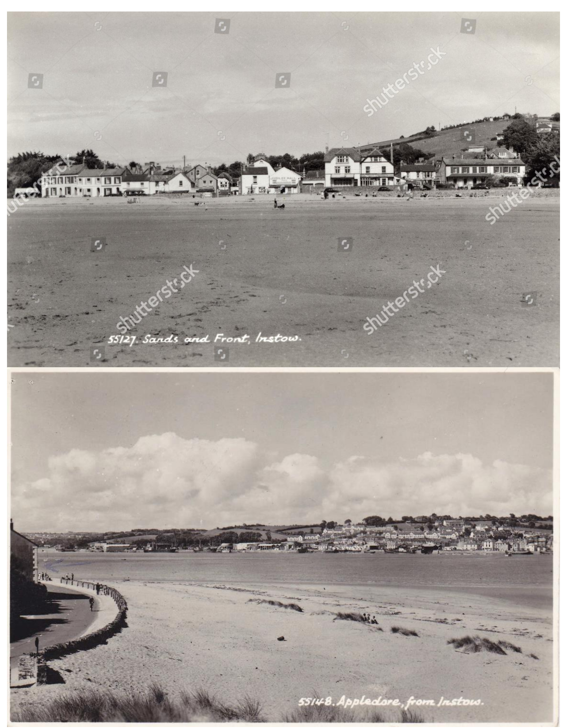
Figure 1 Instow beach circa 1920/30 and c1940/50 indicating the higher elevations at the north end of the beach.

Sand accretes on the beach and has been building the dunes from the north of the beach that have been extending south since 1947 at least.