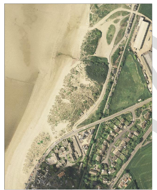
g) 2006 Aerial Photo