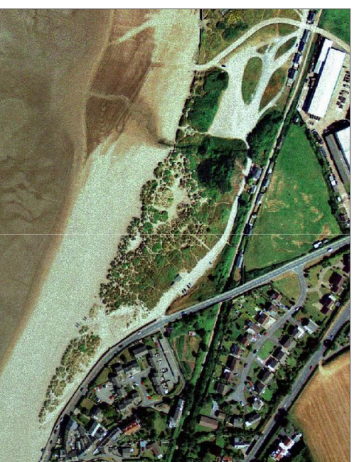
f) 2000 Aerial Photo