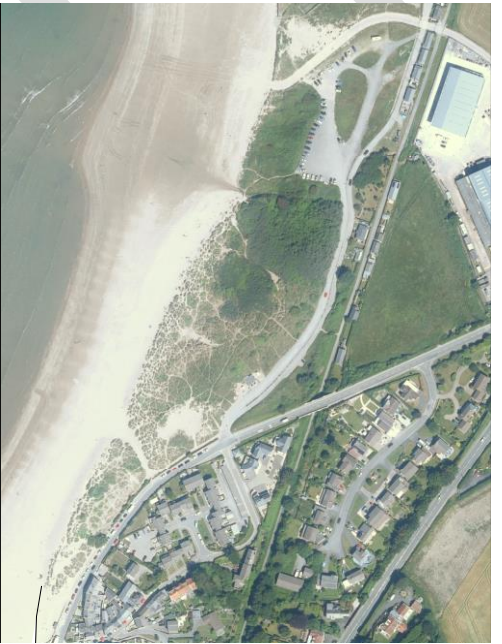
h) 2015 Aerial Photo

Sand accretes to the level of the wall and overspills on to the road. This creates a safety and amenity problem for the road and footpath users. The problem and risk have not been quantified. The assumption deployed in this paper is that the movement of people and vehicles around the sand will lead to an accident resulting in damage to property and potentially life.