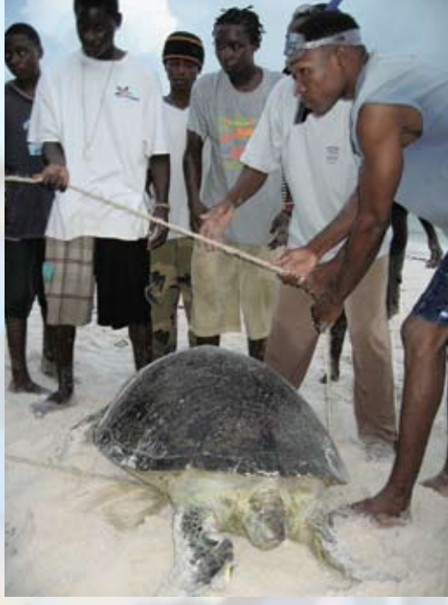
The community now takes protecting turtles seriously. When disaster strikes and one is found drowned in a fishing net, like here, it is given a dignified burial on the beach.

It is not just the impact of sea-level rise that has the biosphere reserve management committee worried in Malindi. The main problem is poverty. It spawns mangrove deforestation, poaching and overfishing, even