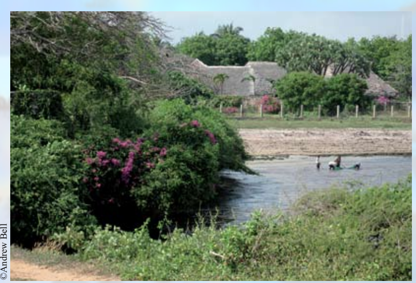
Fishermen with their nets in shallow water at Malindi

The situation is not without conflict, as passionate local community groups try to stem the tide of uncontrolled coastal development and stop destructive illegal fishing and mangrove-cutting. The Malindi Watamu community seems to be far more in touch with the value and the services that their ecosystems provide and therefore more willing to work with them. Perhaps this is what Kenya has to offer the UK.