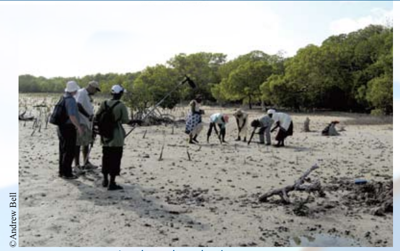
Local people replanting mangroves under the watchful eye of the TVE camera

The large-scale climate models and IPCC reports give some indication of what to expect but we also need a more local understanding of the impact of climate change, in order to adapt before it is too late. This is even more urgent for developing countries, which are likely to bear the brunt of climate change. There is no time to lose in strengthening collaboration between countries which have the technology