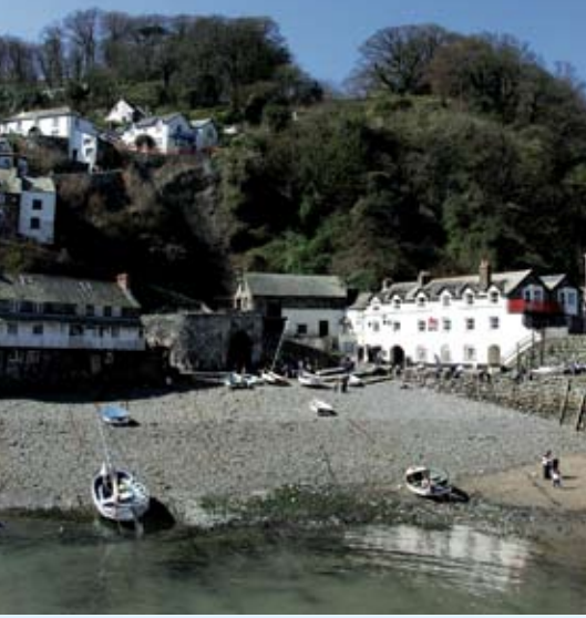
Clovelly, a typical north Devon fishing village clinging to the eroding cliffs. Around 60 000 of the biosphere reserve's 150 000 inhabitants live within 1 km of the coast and estuary. .

Malindi Watamu Biosphere Reserve in Kenya and Braunton Burrows-North Devon's Biosphere Reserve in the UK have a lot in common. They may be thousands of kilometres apart with very different climates but they share similar problems. Although one coastline is dotted with coral reefs, sandy beaches and mangroves and the other with marshlands, dunes and popular surfing beaches, both are in the frontlines of the battle being waged against the elements. Sea-level rise and erosion are eating into their beautiful coastlines, threatening the economy and people's livelihoods. The wildlife habitats and beaches that are a draw for tourists are being threatened not only by these natural phenomena but also by unsustainable development. Last year, the communities of Malindi Watamu and North Devon decided to engage in an experiment. By twinning their biosphere reserves, they hope to learn from one another how best to adapt to their changing world.